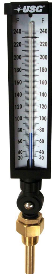
Figure 2: 9" Model T-571 with optional Brass Thermowell attached