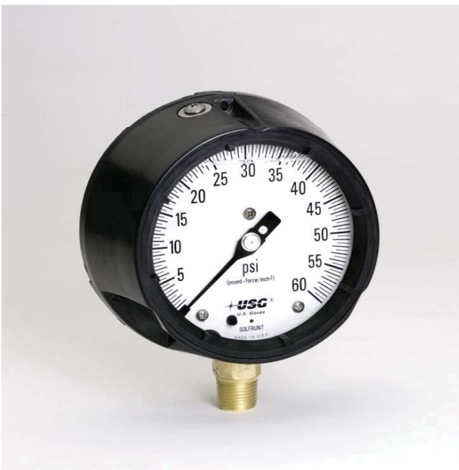
Figure 1: Model 1980EZ

LIQUID FILLING: The standard gauge is dry. Model 1980 is available with EZ-Fill configuration and factory-filled options. Total volume of liquid fill is approximately 1-1/2 pints. Standard fill fluid is Glycerin, with Silicone, Mineral Oil, and other fluids optional.