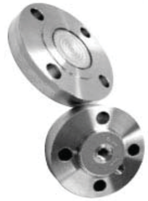
TYPE SFX 1" 150# - 2500# MAX. PRESSURE: 2500 PSI @ 100°F